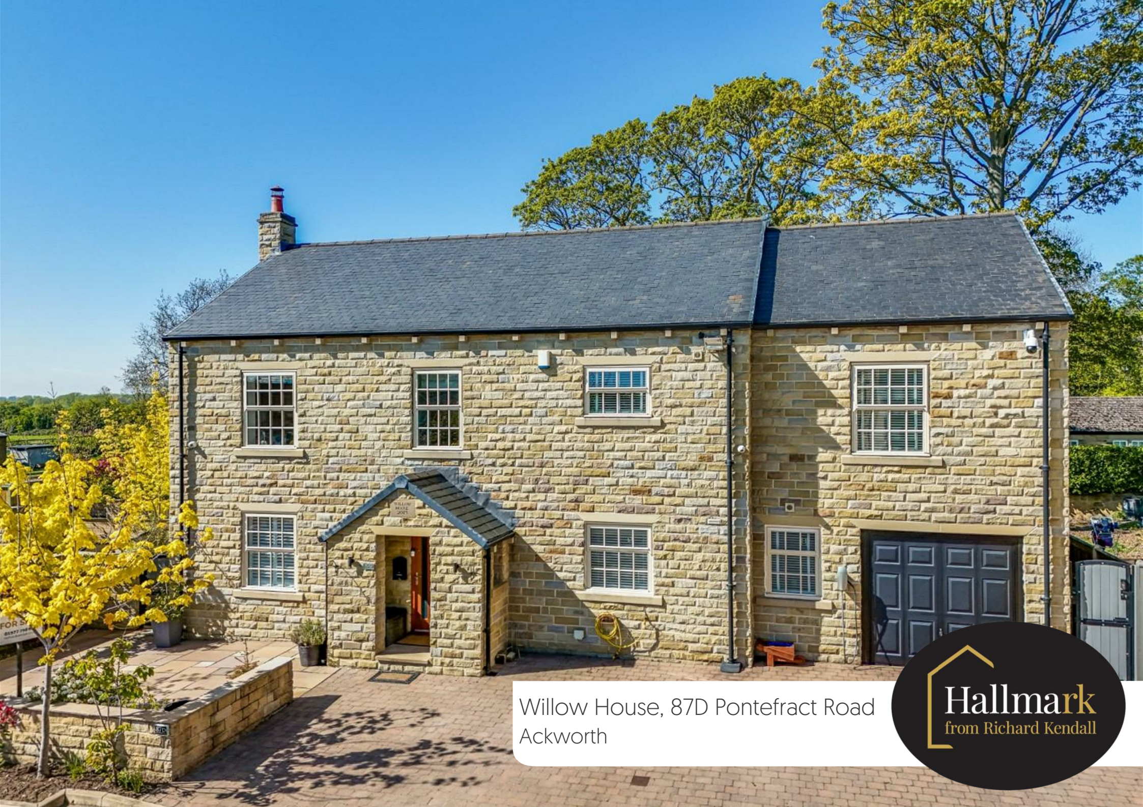
Willow House, 87D Pontefract Road Ackworth